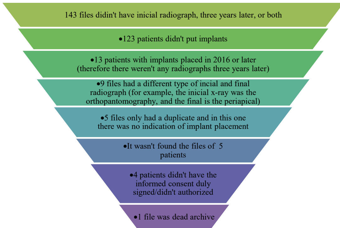
Figure 1. Eligibility criteria: files excluded during data collection

Measurement of bone level in radiographs was done by computer when using digital radiographs (see Figure 2a) and by hand for conventional radiographs (see Figure 2b). In the computer, the SIDEXIS XG program was used, which has analysis tools, such as length measurement, which served, in this case, to measure from the implant platform to the bone level. In the case of conventional radiographs, the measurement was made using a millimeter ruler, as shown below in Figure 2.