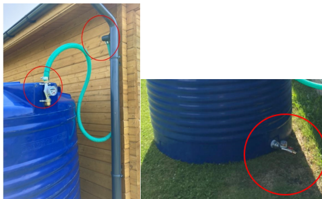
Figure 1. Rainwater harvesting tank in the analyzed farm

Precipitation in the farm is collected only from a part of the roof (roof area 50 m 2 , slope of the roof - 30°). The roof of the building is covered with corrugated sheets of fiber cement. Rain drainage system is installed lead the collected rainwater to an above-ground water collection tank with a volume of 3 m 3 (Figure 1). In the system water-meters were installed in the inflow and outflow sections, and a water filter was installed in the inflow.